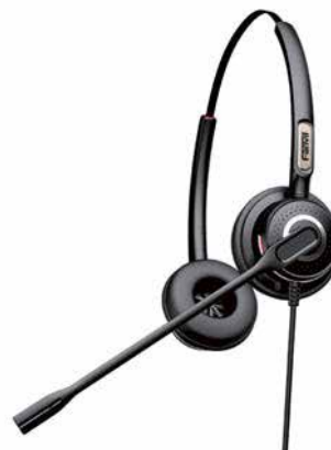
Fanvil - HT202