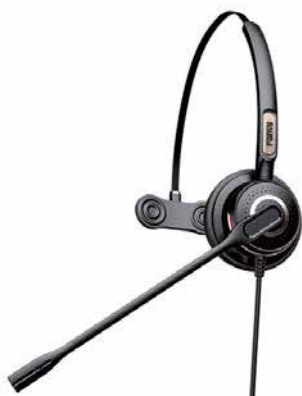
Fanvil - HT201

Fanvil HT201 & HT202 offer a range of premium quality headsets using Fanvil's innovative acoustic technology to deliver speech clarity and an excellent audio experience. Coupled with our sleek design that focuses on comfort and durability, the Fanvil HT201 & HT202 headset offers a new level of experience for call center professionals.